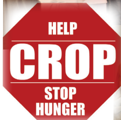
Youth Group prepares to head off to the 2007 CROP Walk...